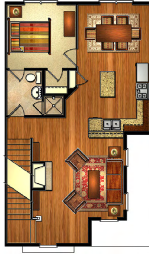
second FLOOR 783 square feet